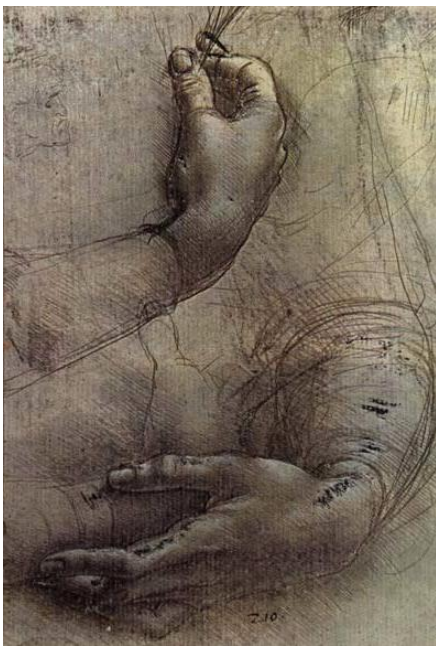
Leonardo, Study of a woman's hands, c.1490

Warwick Business School 3 rd June 2008 10 am – 5 pm